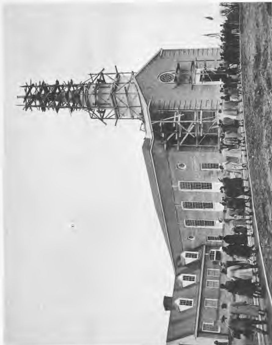
FIRST PRESBYTERIAN CHURCH December 9, 1951