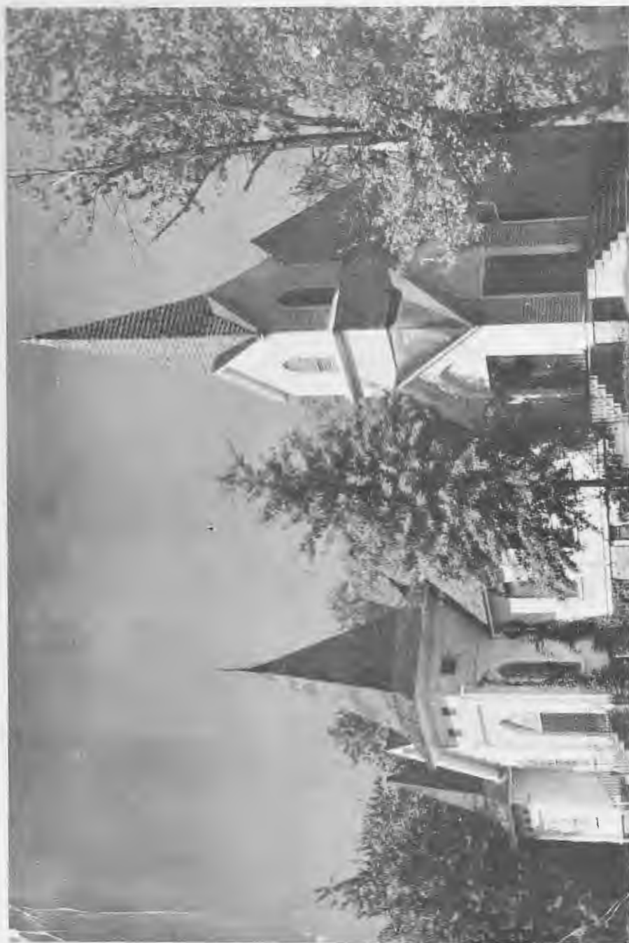
FIRST PRESBYTERIAN CHURCH 1874-1951