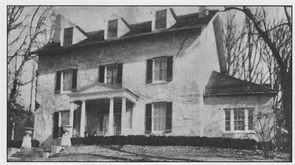
AHS Newsletter, Fall 2013