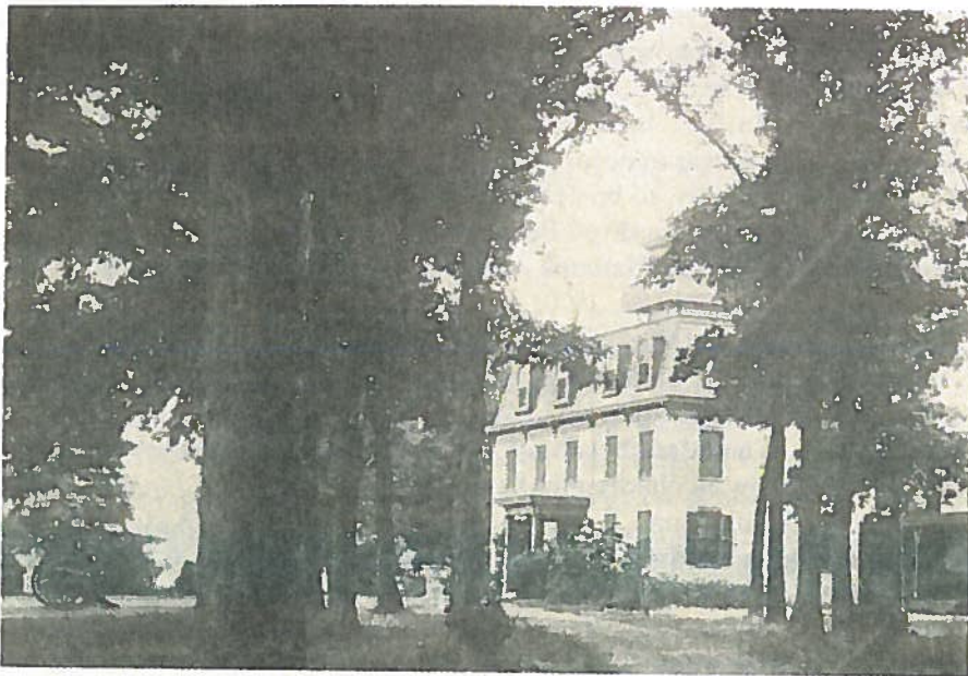
Warwick as it appeared in 1899. The cannon on the lawn was captured with Jefferson Davis.