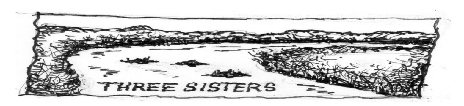
Each issue of the AHS Newsletter offers "Three Sisters" to showcase three historical things that make Arlington so unique. The Three Sisters are a person, a place, and an artifact from the AHS collection.